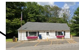
ANDOVER POST OFFICE - MILE 10

MEASURED ON APRIL 16, 2020 MEASURED BY PLATT SYSTEMS KEN@PLATTSYS.COM SHORTEST POSSIBLE ROUTE MEASURED